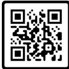
2022 Broadwater Events

Scan QR Code to view photos from all Broadwater 2022 Events