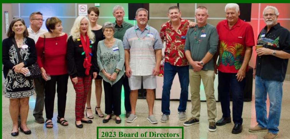
2023 Board of Directors