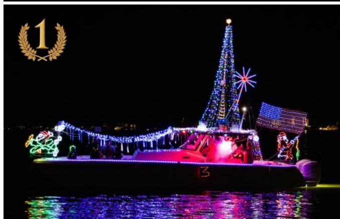
1st Place: #3 Santa's Tropical Christmas Les Weiss & Crew