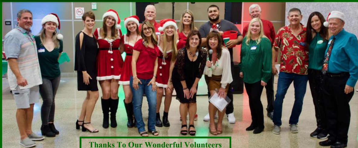
Thanks To Our Wonderful Volunteers