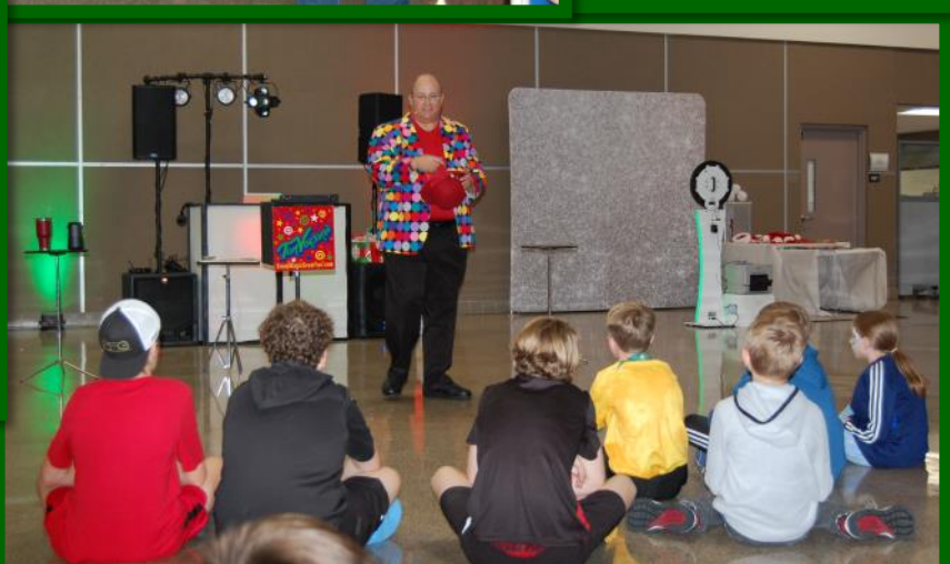
19 TH ANNUAL BROADWATER HOLIDAY PARTY & ANNUAL MEETING