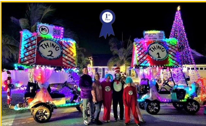
1st Place: #1 Thing 1 & Thing 2 The Joyners & The Mosses